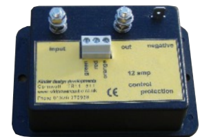
remote circuit breaker

Operation is the same as any other switch on the panel, switch on and the indicator light will show operation, if the remote circuit breaker trips, the warning light comes on. To reset a tripped breaker, switch off and wait 1 a minute, the circuit breaker will reset if the fault is not permanent. If the circuit breaker fails to reset there is a permanent fault that needs correction, the circuit breaker will then reset.