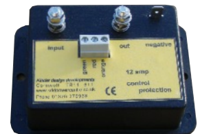
remote circuit breaker

Operation is the same as any other switch on the panel, switch on and the indicator light will show operation, if the remote circuit breaker trips, the warning light comes on. To reset a tripped breaker, switch off and wait 1 a minute, the circuit breaker will reset if the fault is not permanent. If the circuit breaker fails to reset there is a permanent fault that needs correction, the circuit breaker will then reset.