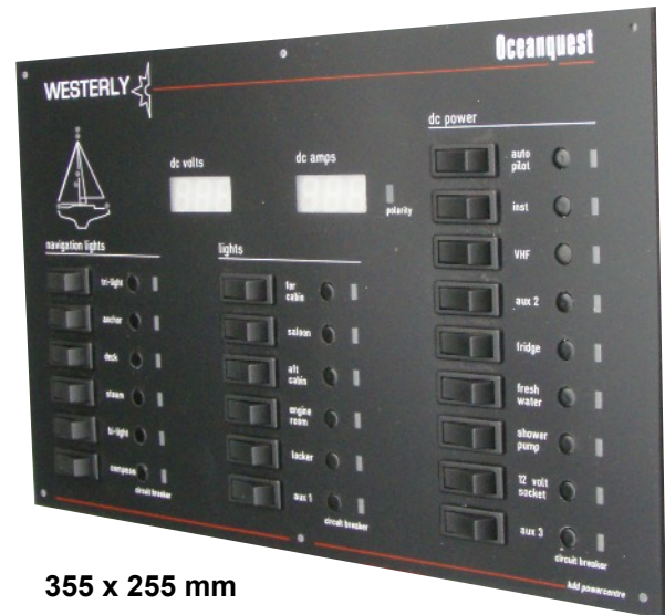
355 x 255 mm

The switch panels are supplied pre-wired, including output cabling to connecting block, providing clean simple installation